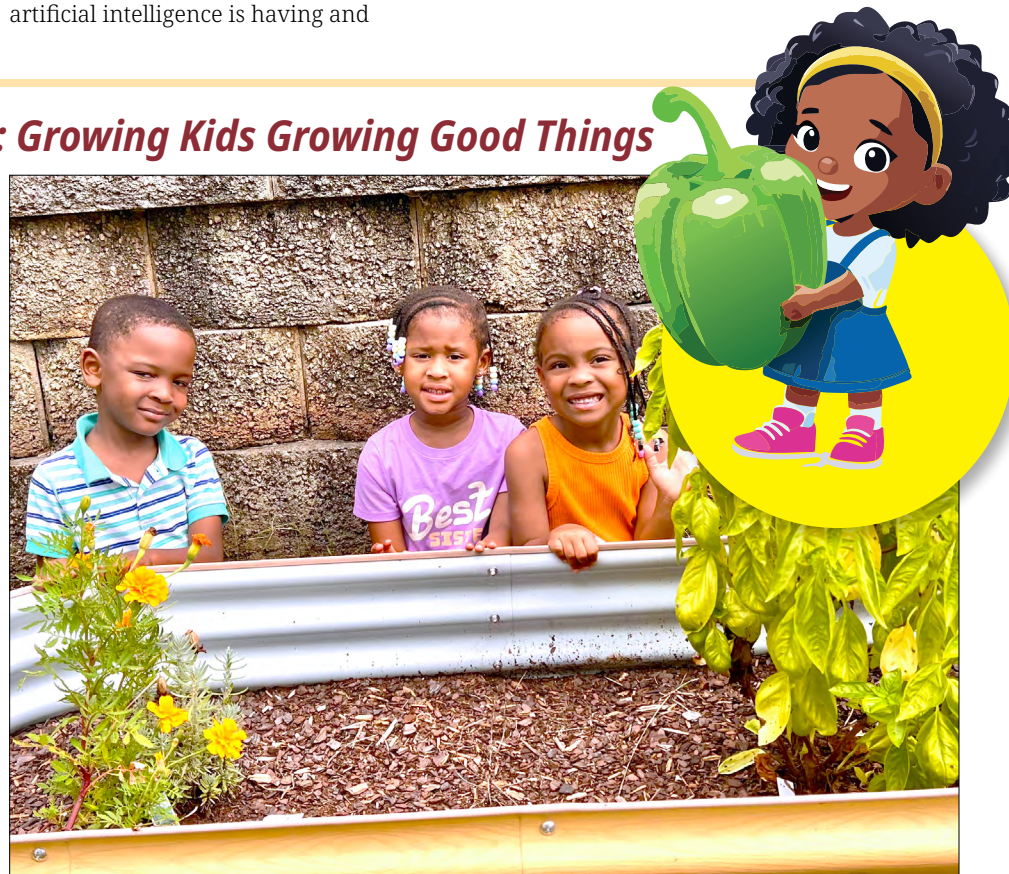
Children at the Child Development Center display their gardening handiwork in raised garden beds.

This summer, interns from NCSU and the University of North Carolina facilitated hands-on cooking activities with the CDC students. The children were able to eat cucumber sandwiches and pesto (with French bread) which they made from produce they planted and grew.