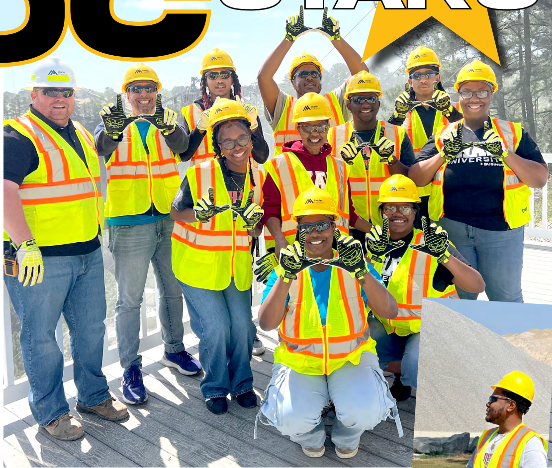
It was a gulp of learning on the rocks as Martin Marietta staff provided Shaw U students an amazing view of the aggregate world during their spring tour.